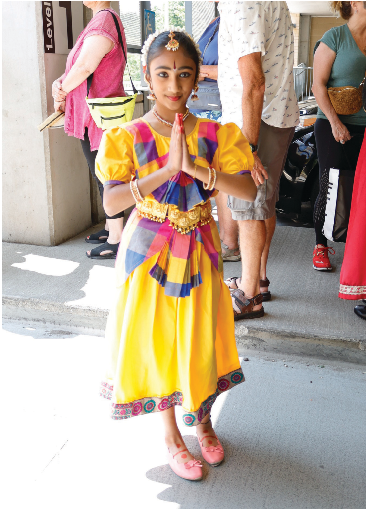
A performer with a children's dance group in the India Garden at One World Day on Aug. 27, 2023.