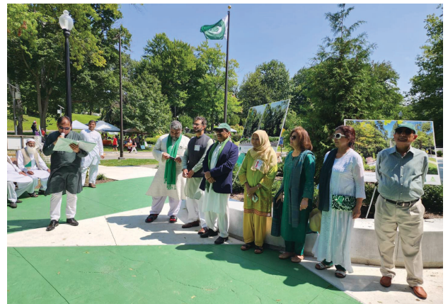
The dedication ceremony for the Pakistani Garden at One World Day 2023