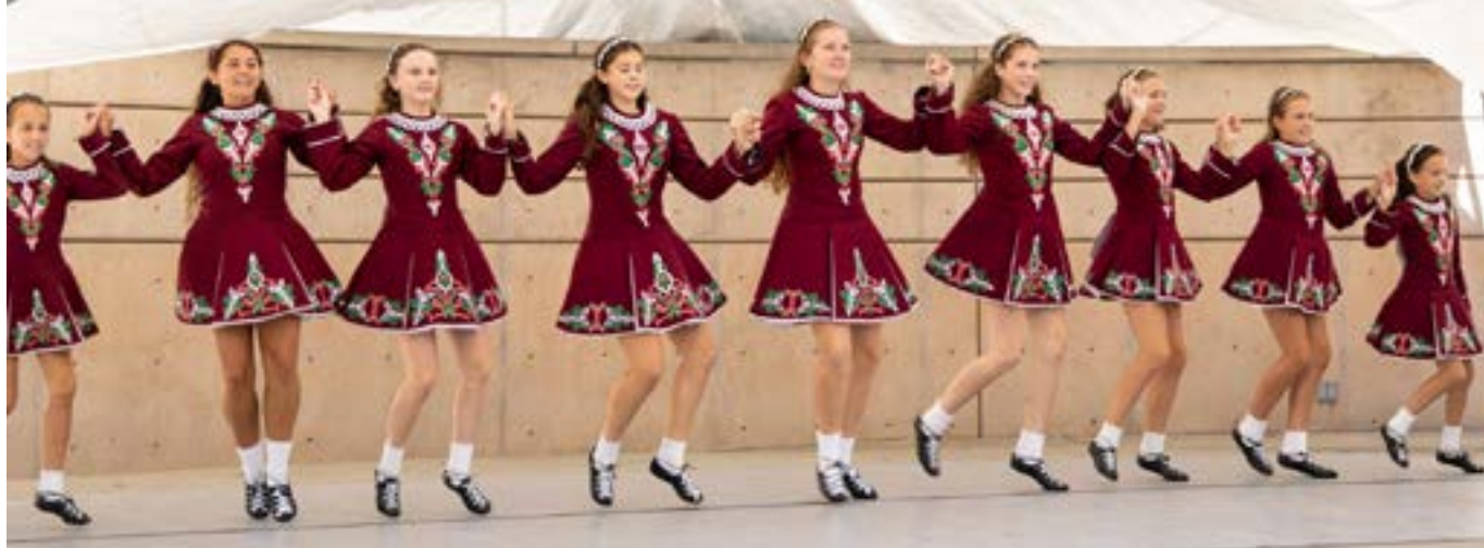
The Murphy Irish Dancers perform.

CCGF expanded its World on Stage impact in 2025 by collaborating with the long-running Wade Oval Wednesday concert program offered by University Circle, Inc. CCGF co-hosted a Wade Oval Wednesday that focused on cultural groups performing music and dance from across the world. The collaboration promoted One World Day 2025 and World on Stage programs later in the season. The annual holiday celebration at the Centennial Peace Plaza in December featured the choir from Antioch Baptist Church and a visit from Santa to give presents to children from the neighborhoods near the Cleveland Cultural Gardens.