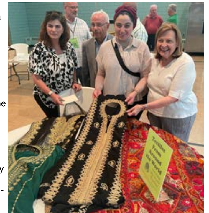
Representatives of the Iraqi community prepare their textiles for OWD.

Kazakh Cultural Garden: The Kazakh community in Northeast Ohio includes about 100 people from 40 families. They began participating in local cultural events in 2023, including the 2023 One World Day and several Asian festivals.