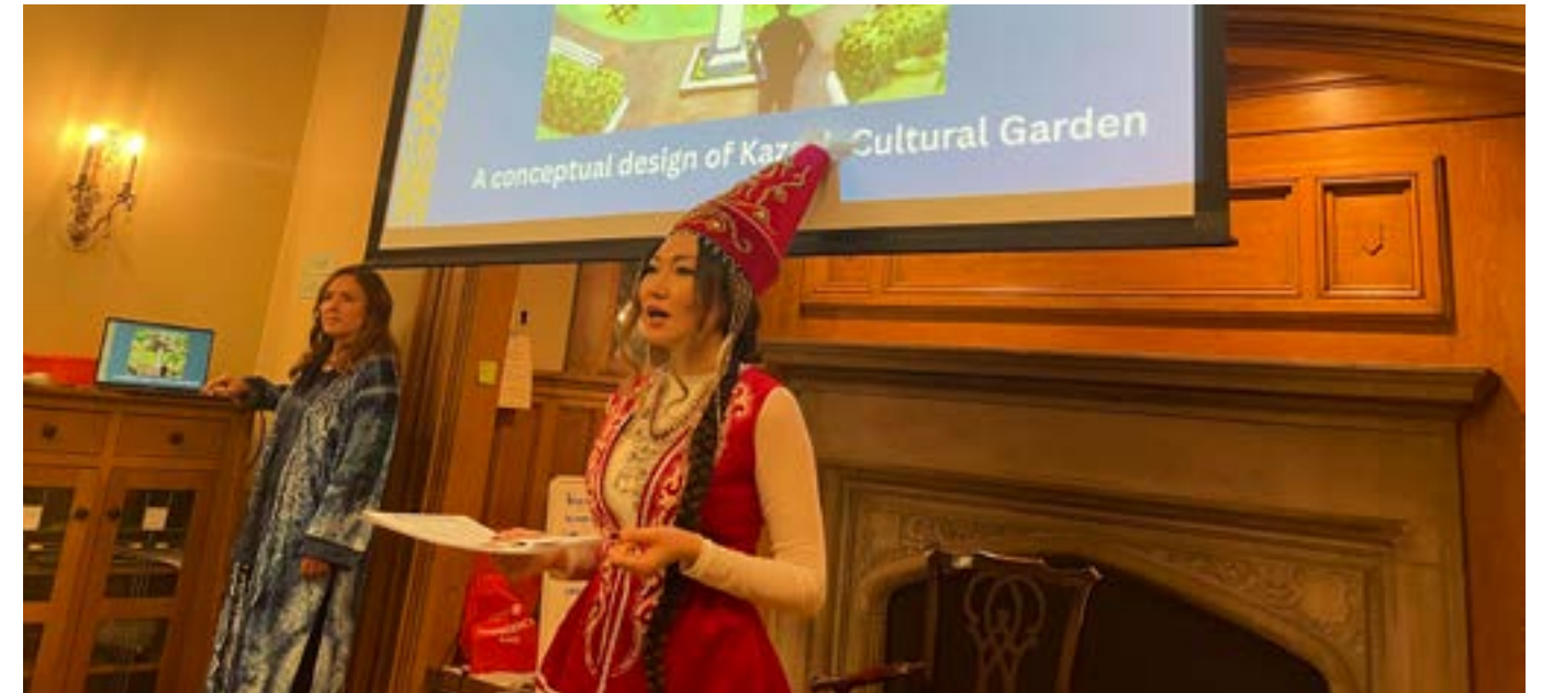
Representatives of the Kazakh community present to the CCGF board.